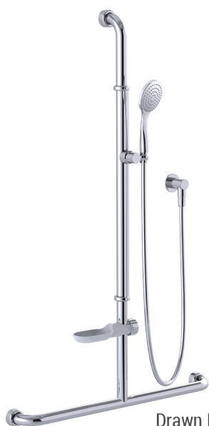
Drawn MF (Middle Fix)